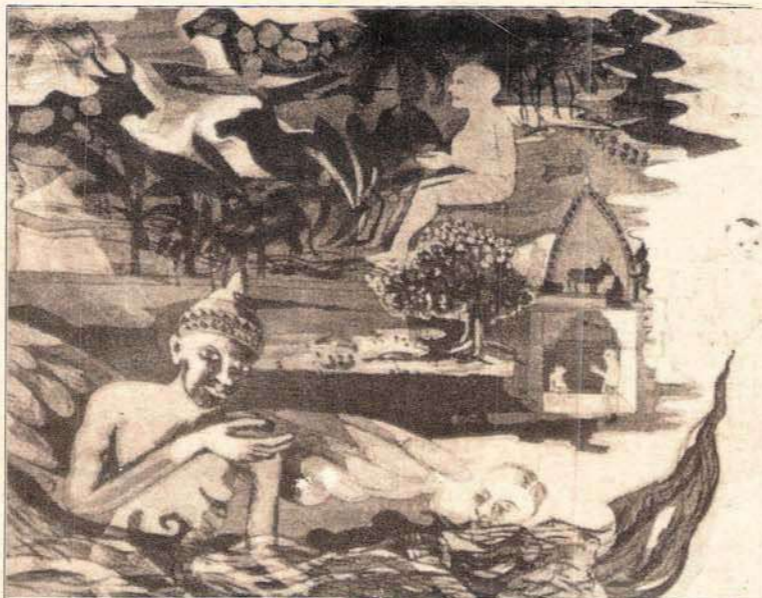
Sneak preview! Some of the exhibits: Left: "Birth of Water" by