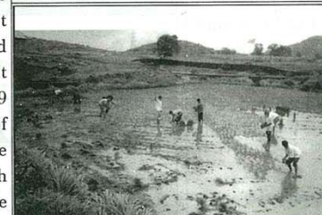
Patients being rehabilitated through agriculture.

Shraddha Rehabilitation Foundation was founded in 1988, to deal with the mentally-ill roadside destitute who are living off the streets and are left lonely, haggard and stripped of all human dignity. In 1997, Shraddha expanded its services with a 30-bed hospital in Dahisar.